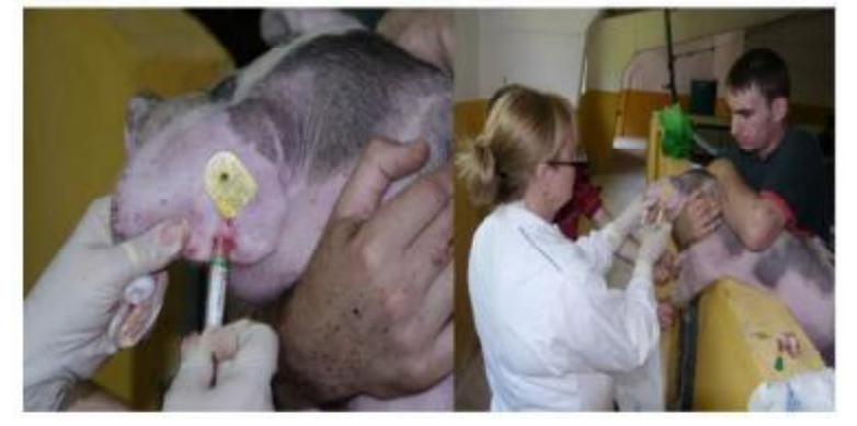
Fig. 1. Blood sampling

adsorbent additive Vitacorm PEO-M on the body of the pigs. At the beginning (06.06.2012) and at the end (05.11.2012) of the experiment, blood samples were taken for subsequent analysis of the biochemical and morphological parameters in the laboratory. Blood samples for analysis were taken from three pigs from each group (Figure 1).