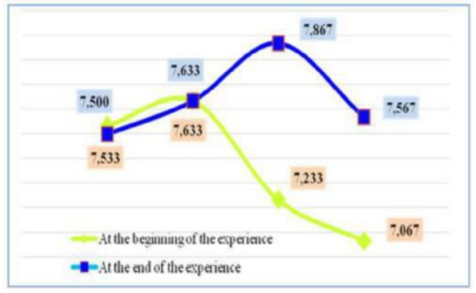
Fig. 2. The content of red blood cells in pigs, 10^{12}/l

It is known that with age in the blood of animals there is a tendency of increasing the number of erythrocytes and leukocytes, while reducing the hemoglobin content, reducing the color index, but the number of blood platelets remains almost unchanged. Consequently, hemoleukopoesis in 6-7-month-old animals slightly increases, which can be associated with high growth energy of the individuals of this age. The number of leukocytes in the experimental groups EG<sub>1</sub>, EG<sub>2</sub> and EG<sub>3</sub> under the influence of the adsorbent inclusion was higher in comparison with the control animals by 0.660, 0.133 and 2.77*10^9/1 , respectively (Table 3), which indirectly characterizes the degree of resistance of the body.